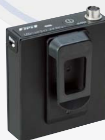
Enloop Battery Set 50-160-10