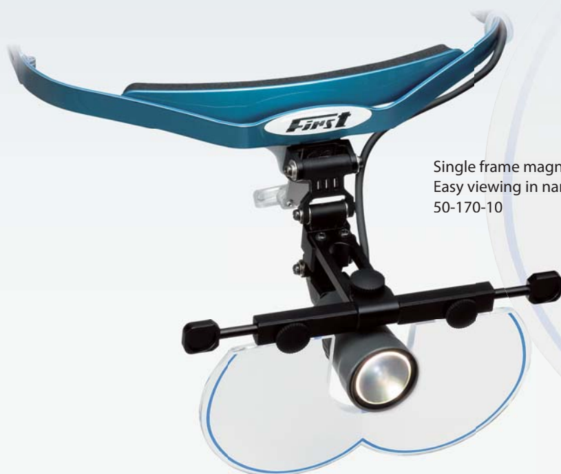
Single frame magnification lens (x 1.7 / x 2.0) Easy viewing in narrow areas 50-170-10